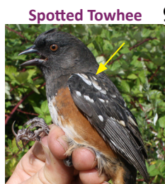
Spotted Towhee ♀

White patch on primaries below primary coverts