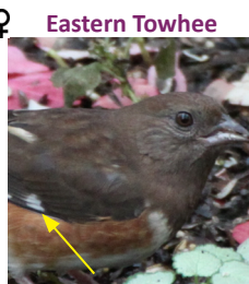
Eastern Towhee ♀