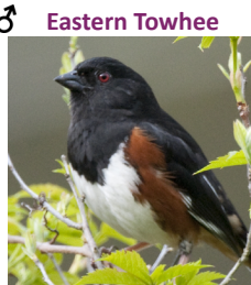
Eastern Towhee ♂