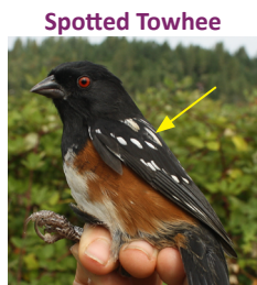
Spotted Towhee ♂